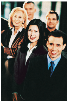
The world's leading sales training system